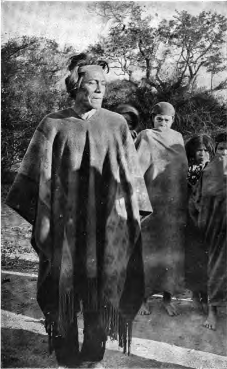
FIG. 2—A Chané Indian, Rio Parapiti, Bolivia.