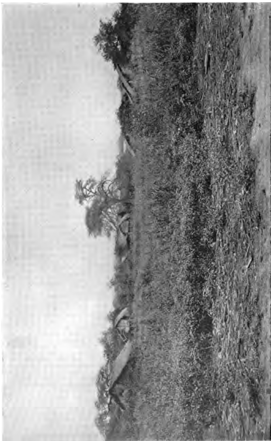
FIG. 3—One of the Chiriguano villages that line the eastern foothills of the Andes from a little south of Santa Cruz to the Argentine frontier. The Chiriguano village is seldom large, being composed as a rule of eight or ten straw-thatched huts.